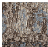
cotton chenille Radja