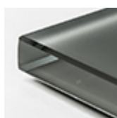
extra clear graphite