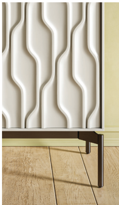
STONE & BRUSHED CARBON

Mesa cabinets are available in two finishes—Stone and Moss—and two base options—Brushed Brass and Brushed Carbon.