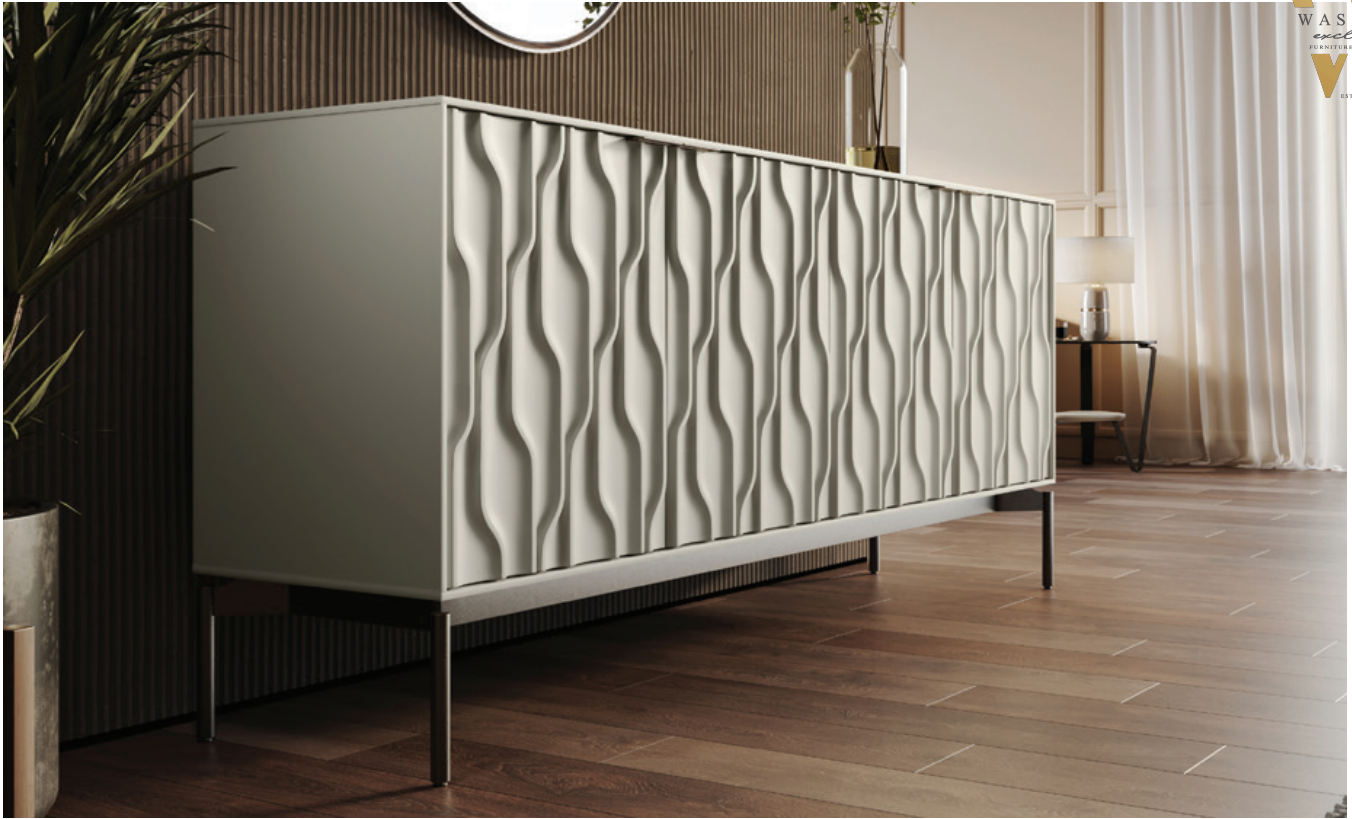
Stone with Brushed Carbon legs