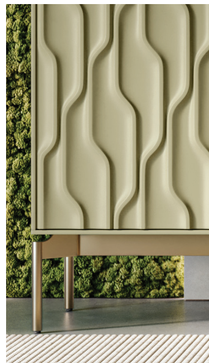
MOSS & BRUSHED BRASS