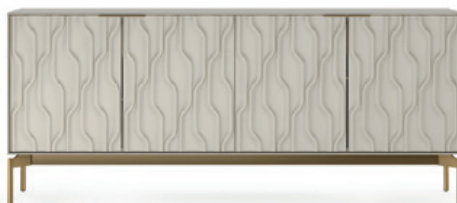
STONE & BRUSHED BRASS

Mesa cabinets are available in two finishes—Stone and Moss—and two base options—Brushed Brass and Brushed Carbon.