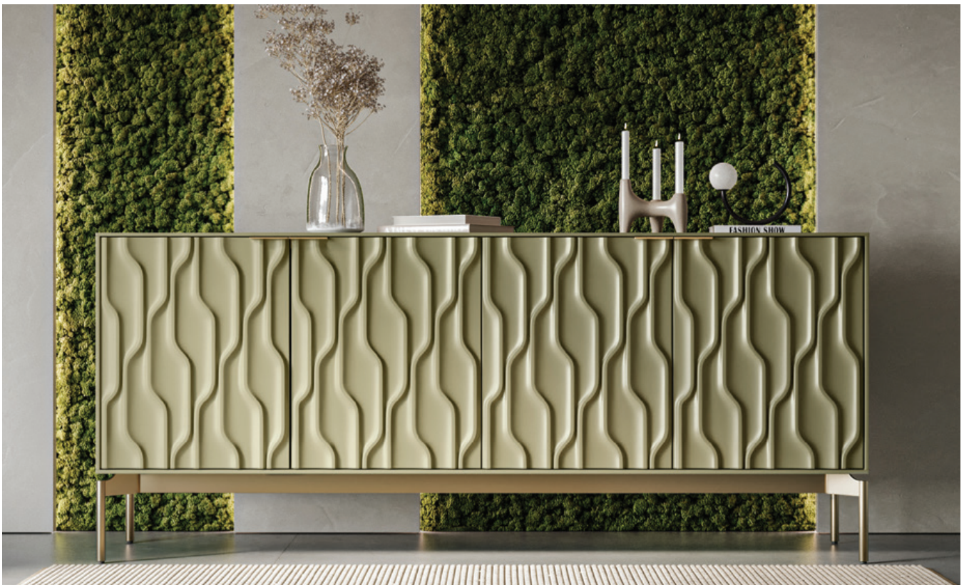
Moss with Brushed Brass legs