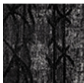
cotton chenille Mumbai