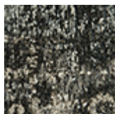
cotton chenille Mapoon