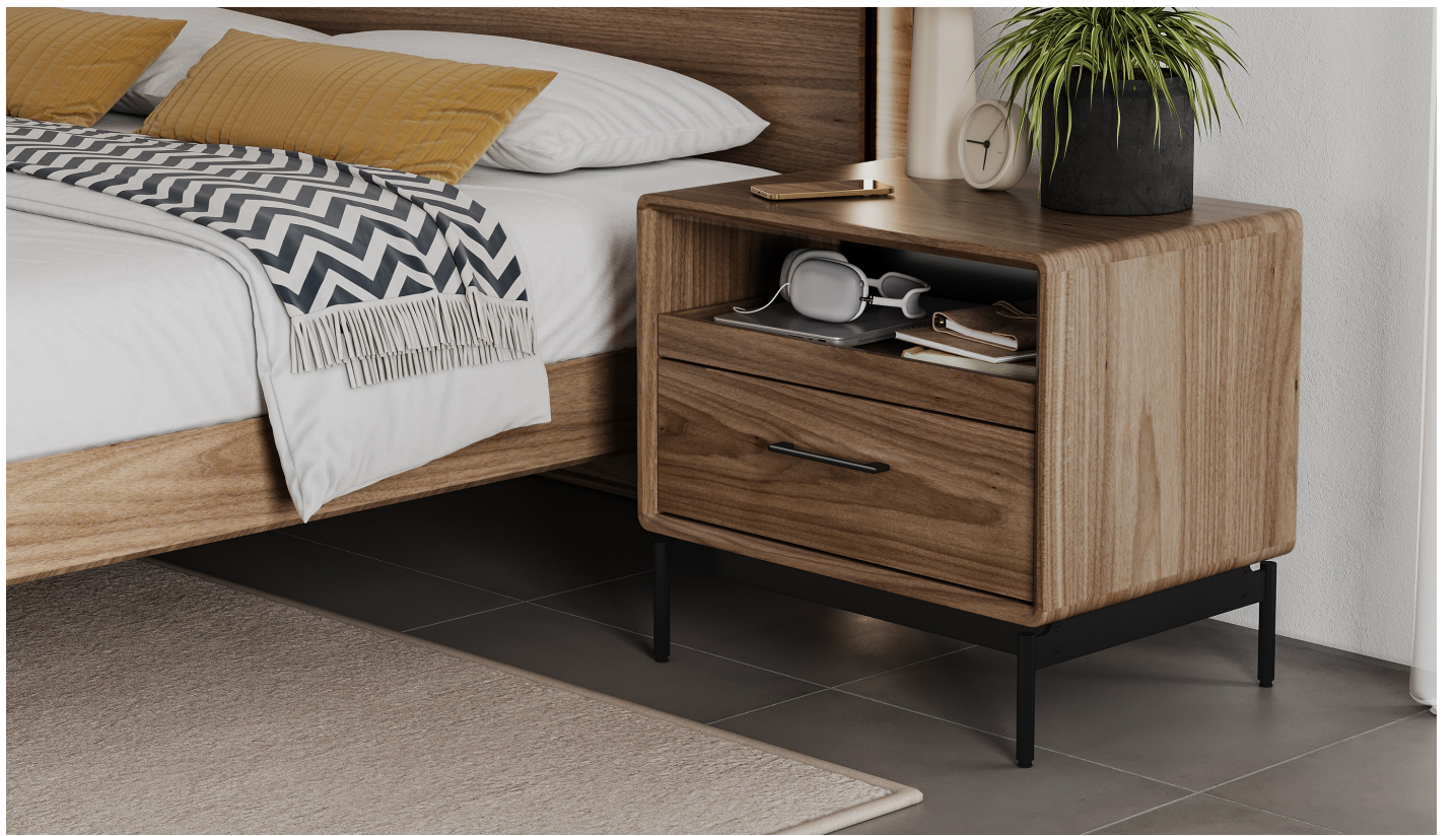
Linq 9182 28" Nightstand