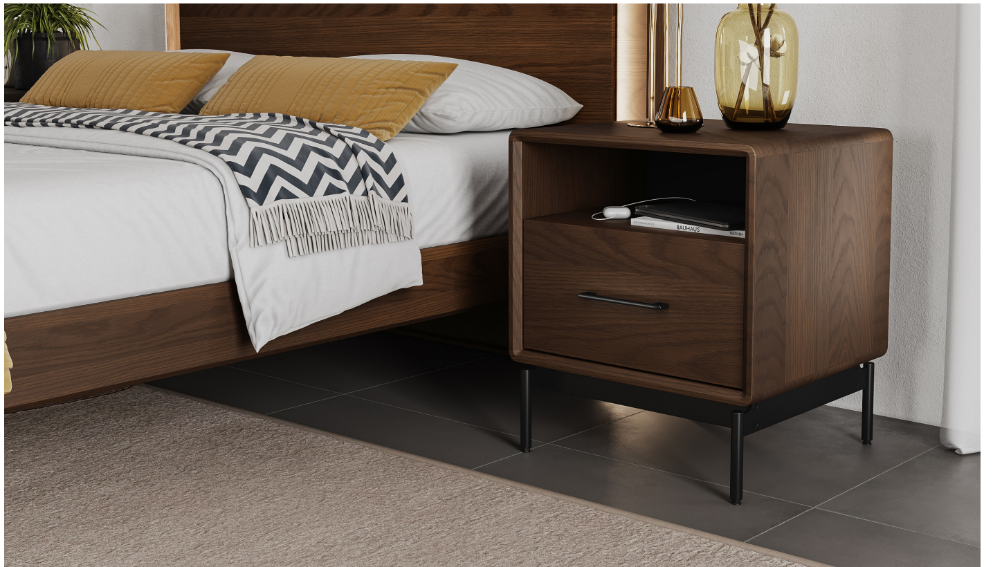
Linq 9181 22" Nightstand