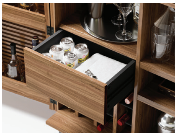
Storage drawer provides a home for utensils, mixers, and other supplies