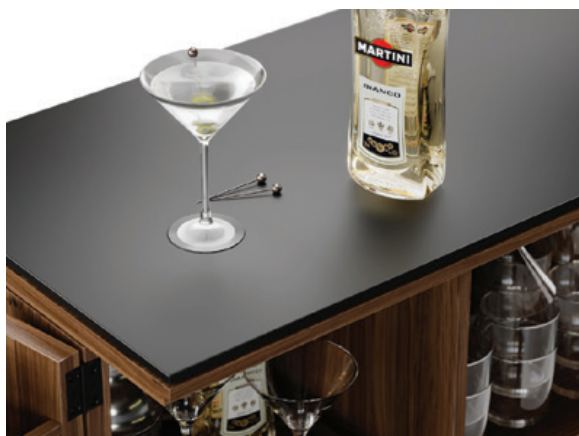
Satin-etched glass top allows for simple clean up