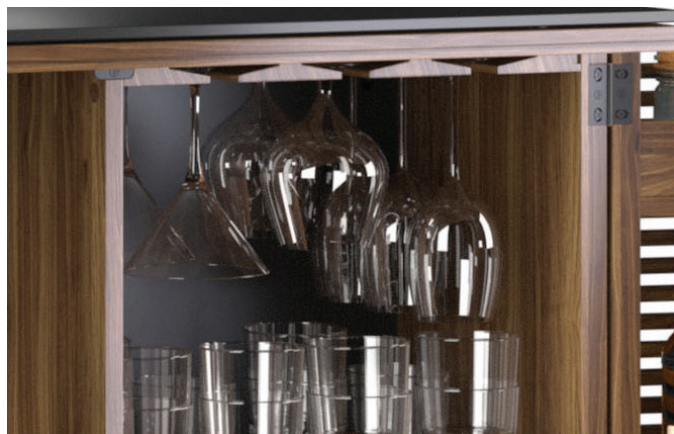
A wooden stemware rack protects glasses and minimizes vibration