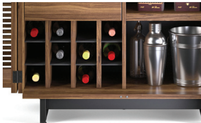
Storage for up to 12 wine bottles